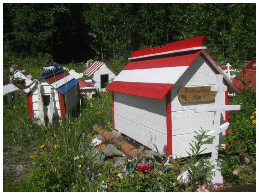
Figure 3 - Funerary miniature wooden houses

The corpses of the dead are buried -or their ashes depositedunder distinctive colorful wooden houses that resemble the cabins of the living (Figure 3). Such indigenous cemeteries are famous in the village of Eklutna, near Anchorage; and they are also present in Whitehorse, where one third of the population is of First Nations ascendency. Although most of the graves are constructed as houses, some of them are meant to represent boats or canoes. The Tlingit believe that the spirit of disease travels in a "canoe of sickness" carrying the souls of those who have died in epidemics (Laguna, 1972: 817).