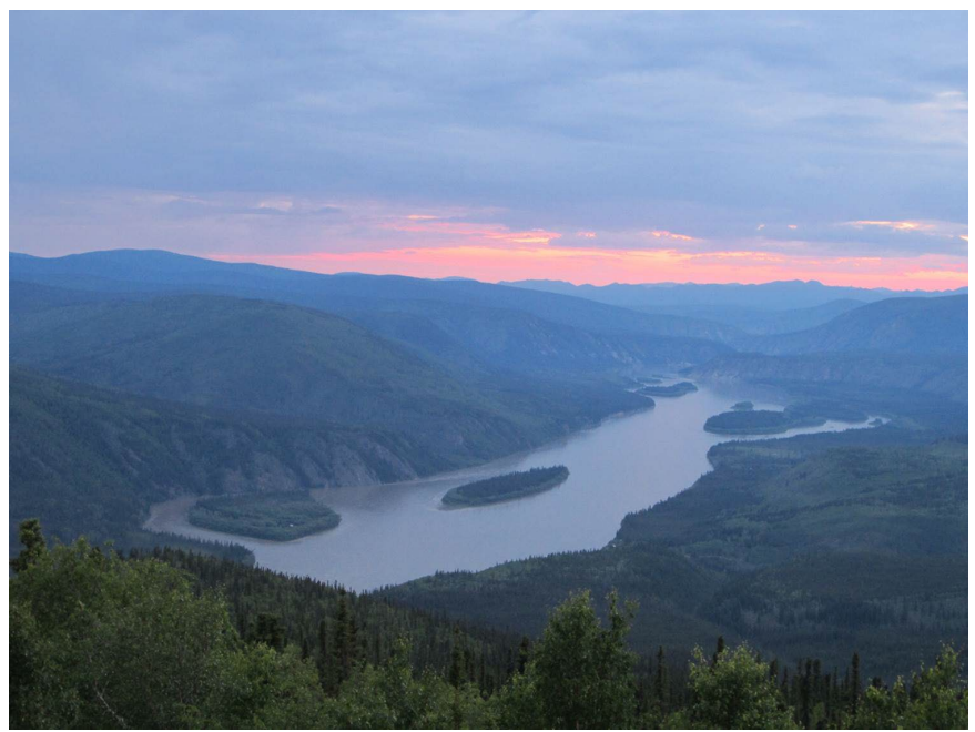
Figure 7 - A midnight hike to the summit of Midnight Dome