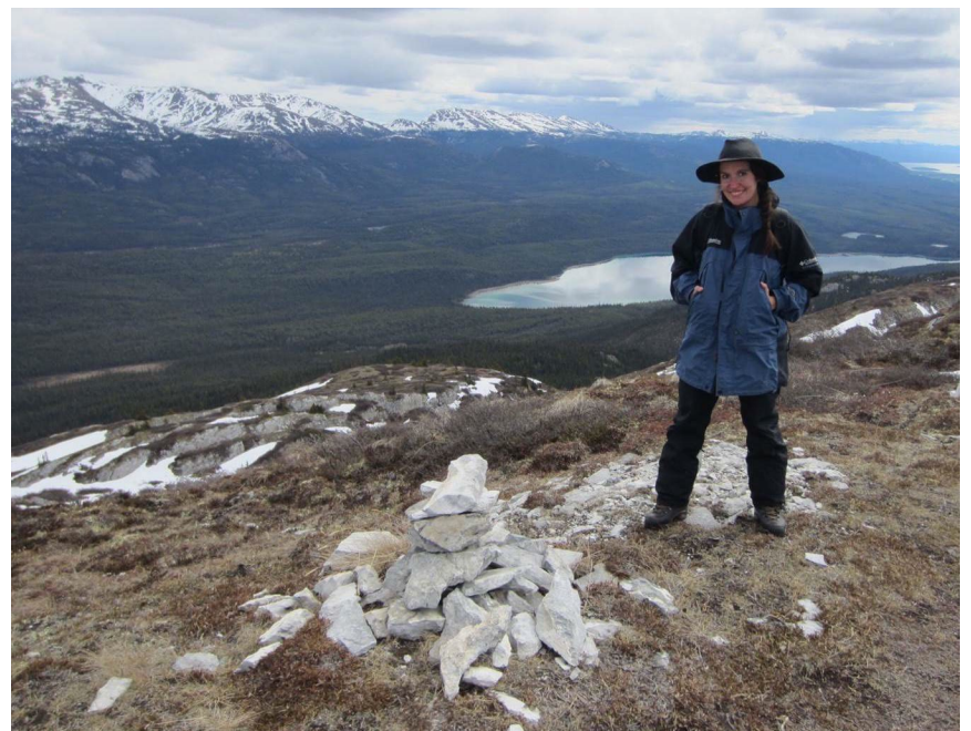
Figure 5 - On the summit of Grey Mountain in Yukon

Grey Mountain is a small massif that rises 4,500 feet above sea level, overlooking the Yukon River valley and the city of Whitehorse (Figure 5). It is also known as "Canyon Mountain", due to a small canyon that forms between the two summits of the peak. Oftentimes climbed by local outdoor enthusiasts, all necessary precautions need to be exercised -including carrying whistles and bear-spray-, since its slopes are home to numerous grizzly bears. I had a chance to hike to the top of Grey Mountain in the company of two residents from Whitehorse and, as a matter of fact, on our way to the summit we spotted a grizzly mother and her cubs frolicking on the shores of a small lake.