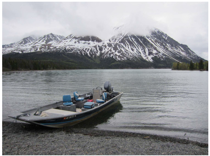
Figure 8 - Kluane mountains and Lake Kathleen