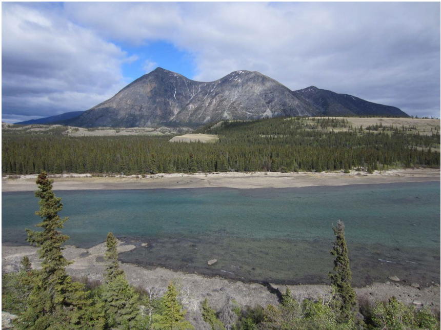
Figure 4 - Rabbit Mountain

Traditional views on mountains in Yukon are mostly utilitarian, rather than sacred in nature. Names such as Rabbit Peak or Ibex Mountain describe the potential of certain mountains as places for hunting, one of the few activities for which mountains may be approached and climbed (Figure 4). The higher and less accessible mountains are perceived as places of fear and danger, which should be avoided as much as possible -especially those peaks covered in massive glaciers in the coastal ranges. Such is the foundation and purpose of the cautionary tales known as "glacier stories", which are popular among the Tlingit.