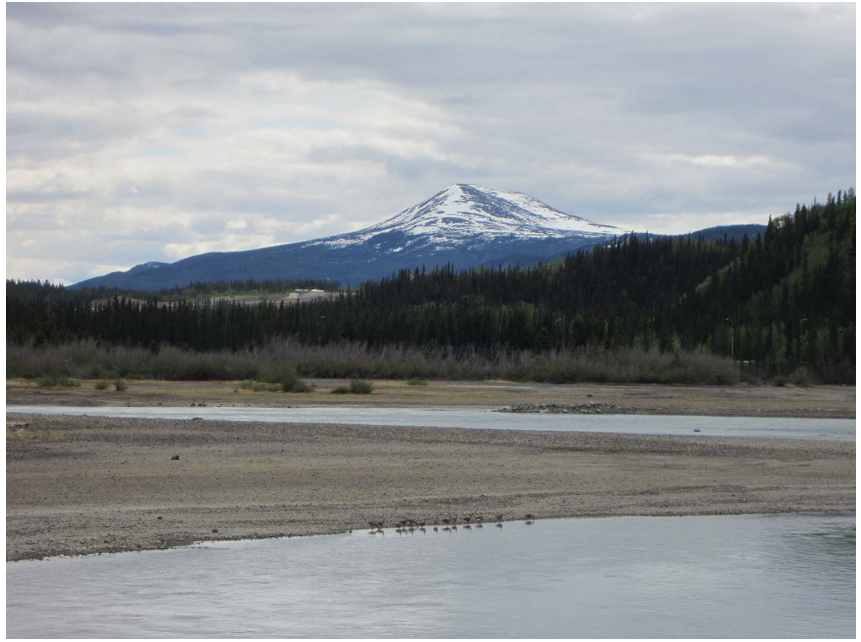
Figure 1 - Mountain landscape in Yukon

led to the discovery of frozen ice age carcasses and fossils belonging to the ancient Pleistocene fauna of Beringia (cf. Zazula and Froese, 2011).