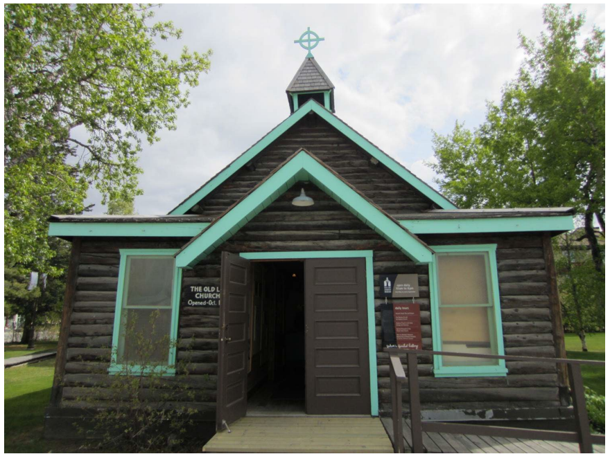
Figure 2 -Old log church in Whitehorse

Historically, the town of Whitehorse bloomed as a river port during the Klondike Gold Rush, when the freights and passengers traveling to the mining town of Dawson City were transferred from the coastal train to a riverboat. Paddlewheels and steamboats would travel upstream during the five months in the year during which the Yukon River remains unfrozen, until the middle of the XX century. The largest sternwheeler on the Upper Yukon River was the Klondike S.S., which has nowadays been turned into a historical site and museum. The cultural heritage of the Yukon Territory is celebrated at the Mac Bride Museum of Yukon History, with reconstructed log cabins, a miner´s saloons, a blacksmith shops, a NW mounted police cabin, a telegraph office and photographic exhibits covering the 1898 Gold Rush, the world wars, and the construction of the Alaska highway.